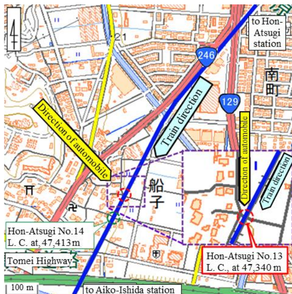
<Rough map of around the accident site>

# This figure was made using the Geographical Institute Map, Electrical Country Web, of the Geospatial Information Authority of Japan