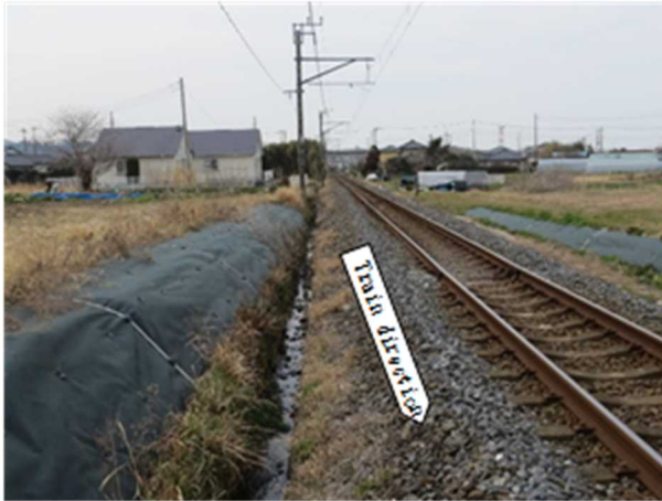
< The view from Renkouji level crossing to the down train approaching side >