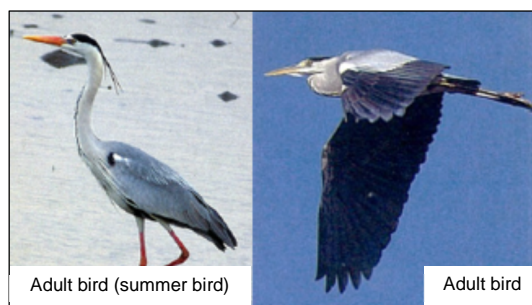
Figure 3 Gray heron

The guideline for the bird strike prevention program* 2 (page 8 of Appendix 1) assessed the risk of a gray heron as, “categorized as one of the most dangerous birds because of its heavy weight and a high probability of causing damage to aircraft, if collided, although frequency of collision with aircraft is low.” In the surrounding areas of the airport including the accident site, rivers and ponds that could be feeding areas and tumulus and green parks that could be breeding grounds for gray herons were scattered.